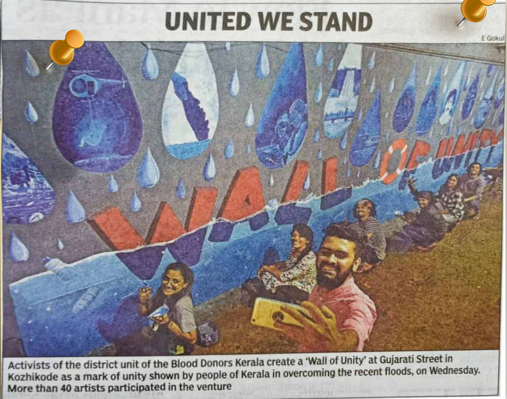
Activists of the district unit of the Blood Donors Kerala create a 'Wall of Unity' at Gujarati Street in Kozhikode as a mark of unity shown by people of Kerala in overcoming the recent floods, on Wednesday. More than 40 artists participated in the venture