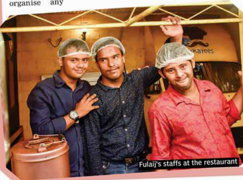
Fulaj's staffs at the restaurant

Being compassionate to others, especially the less privileged, and doing something that brings smiles on their faces is a gesture that will leave you with nothing but a heart brimming with happiness and peace at the end of the day. It's something many people preach, but very few people give their time and make efforts to organise any